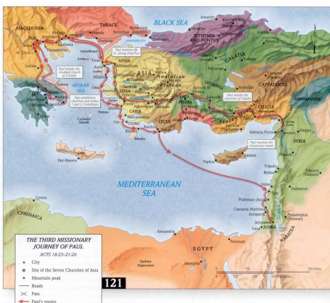
Click to enlarge - from the Holman Bible Atlas (digital book; Hardcover) copyright © 1998 B&H Publishing Group, Used by permission, all rights reserved. This is one of the best resources for Bible maps. Please do not reproduce this map on any other webpage.